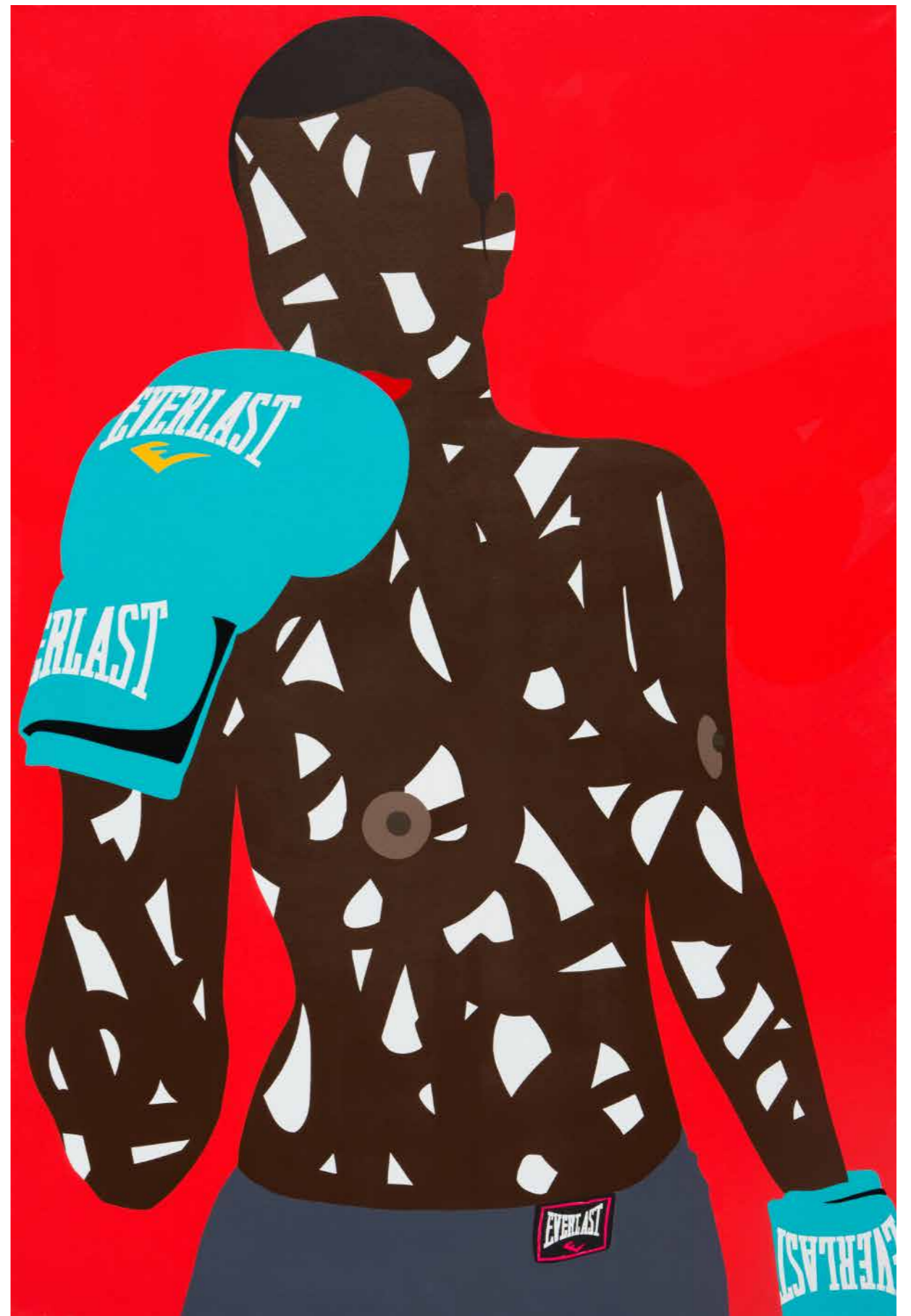
Float like a butterfly, sting like a bee Acrylic on canvas 210 x 140 cm 2017