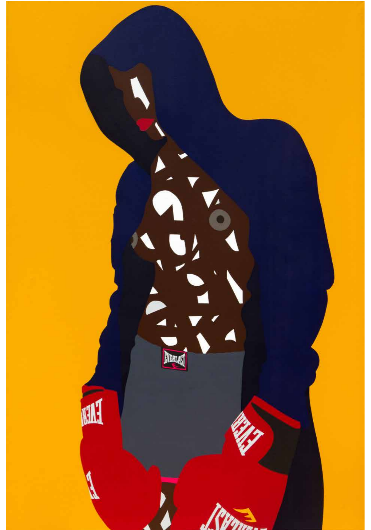
We're not just here to take part, we're here to take over Acrylic on canvas 210 x 140 cm 2017